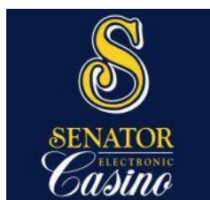
Adria Casino d.o.o.